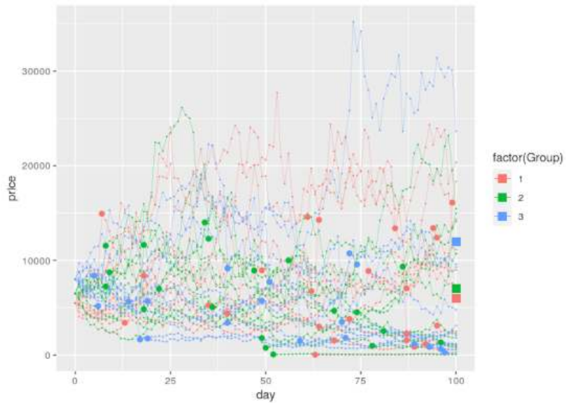
Figure 3: three stock prices: day = 100, monte_carlo = 10, start_price = c(5500, 6500, 8000), mu = c(0.1, 0.2, 0.05), sigma=c(0.11, 0.115, 0.1), lambda = 2, K = c(6000, 7000, 12000). Square points are strike prices. Big round points are jump points.